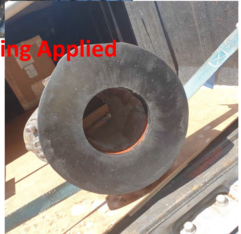
Typical Flange Appearance After Coating Applied